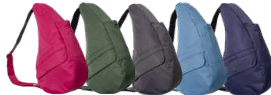
Hibiscus 6401-HI 6403-HI