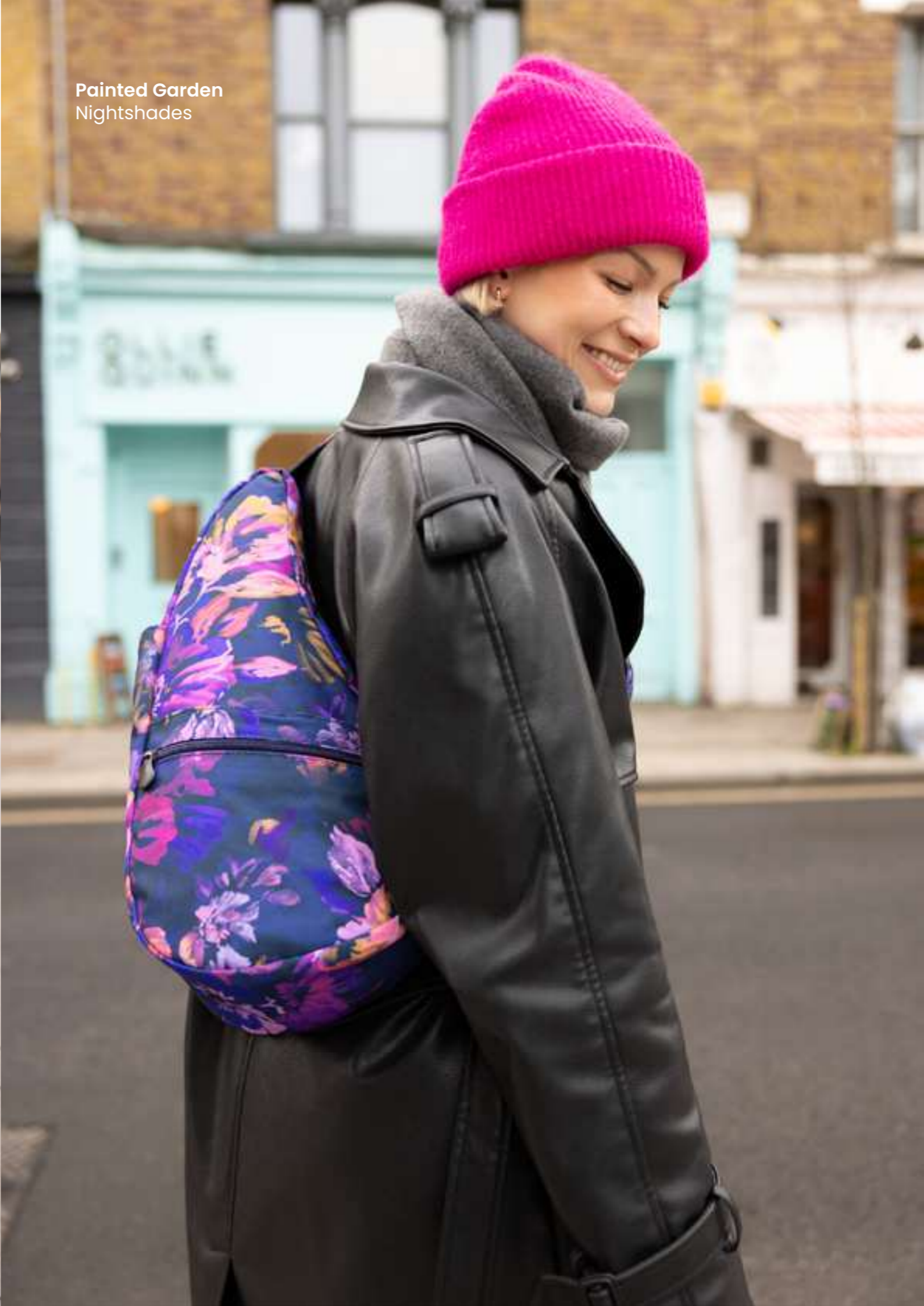
Painted Garden Nightshades