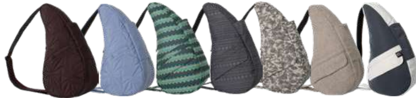
Espresso Quilted 7403-EP