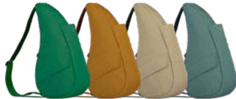
Emerald 6100-EM 6100LG-EM 6303-EM