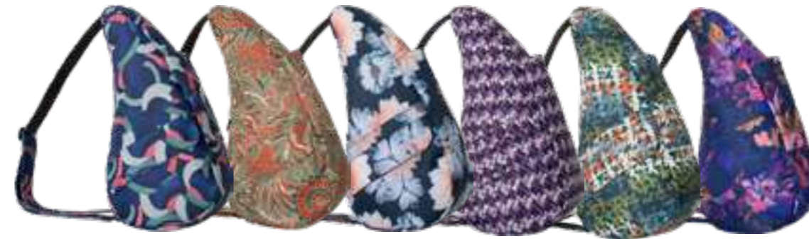
Midnight Spirit 6260LG-MS 6263-MS