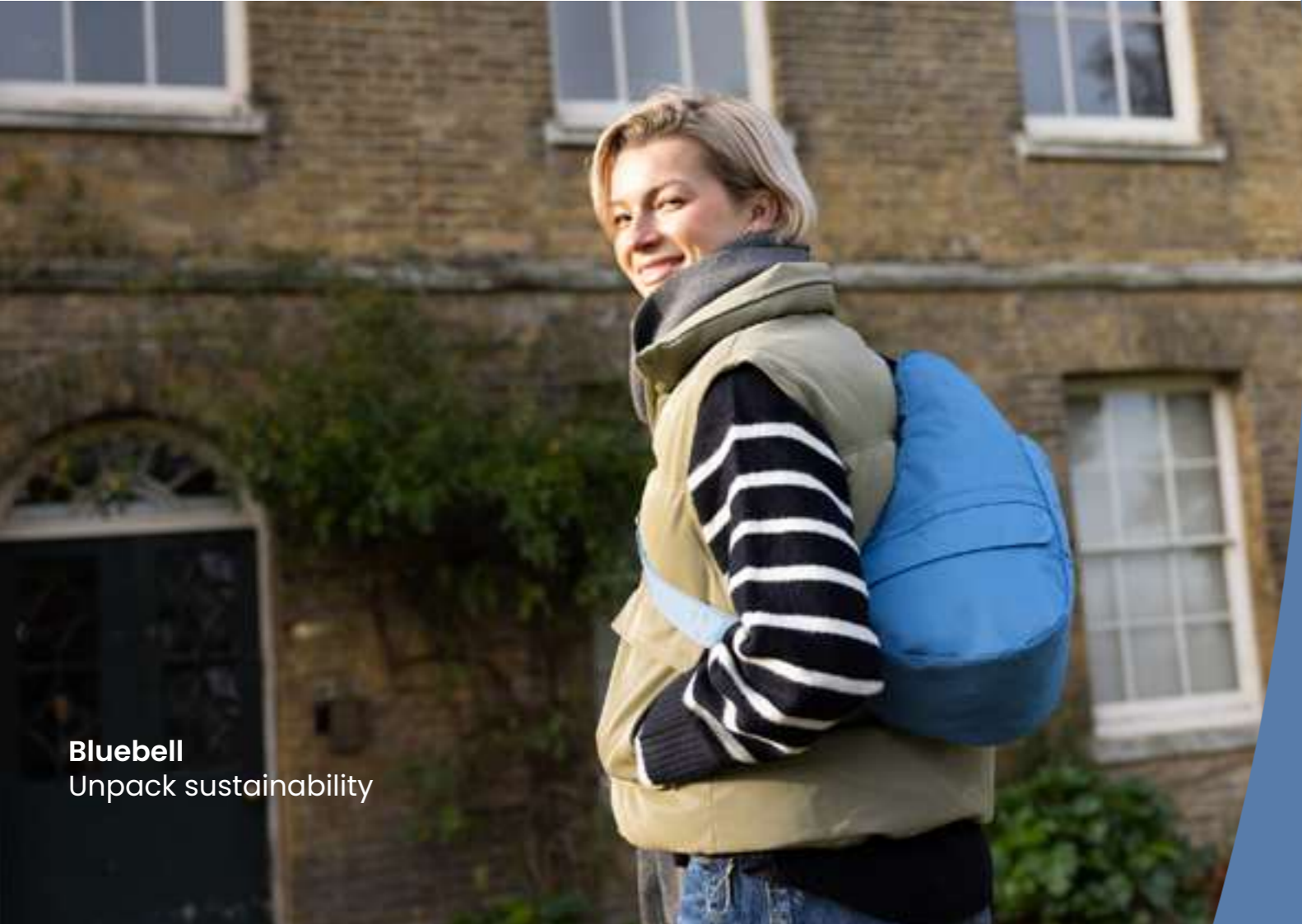
Bluebell Unpack sustainability